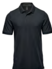
M's & W's: Black