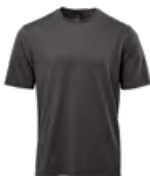
M's & W's: Dolphin