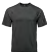
M's & W's: Charcoal Heather