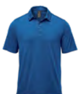
M's & W's: Classic Blue