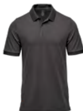
M's & W's: Dolphin