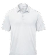
M's & W's: White