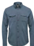
M's & W's: Retro Blue