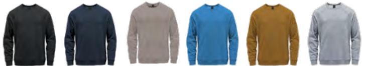
M's & W's: Black