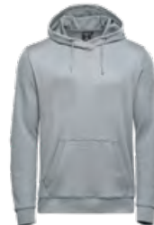
M's & W's: Granite