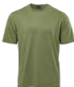
M's & W's: Sage Green