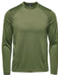
M's & W's: Sage Green Heather