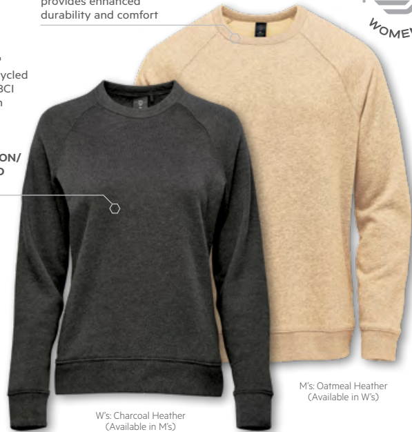
W's: Charcoal Heather (Available in M's)

Pure Earth by STORMTECH™ Made from Recycled Polyester and BCI Sourced Cotton for a reduced environmental footprint 59% BCI COTTON/ 41% RECYCLED POLYESTER