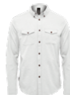
M's & W's: White