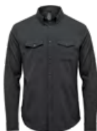
M's & W's: Black