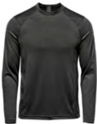
M's & W's: Charcoal Heather