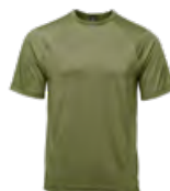
M's & W's: Sage Green Heather