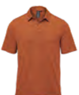
M's & W's: Rust