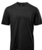
M's & W's: Black