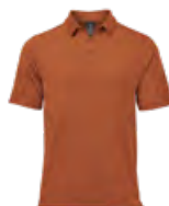
M's & W's: Rust