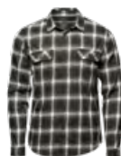
M's & W's: Black/White Plaid