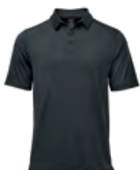
M's & W's: Dolphin