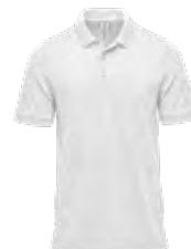
M's & W's: White