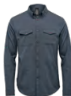
M's & W's: Dark Denim Heather