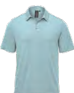
M's & W's: Ice Blue