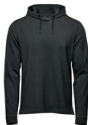
M's & W's: Charcoal Heather