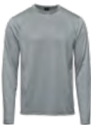
M's & W's: Granite Heather