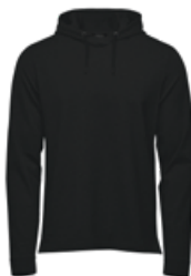
M's & W's: Black