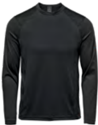
M's & W's: Black