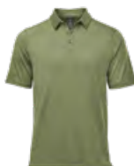
M's & W's: Sage Green