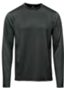
M's & W's: Charcoal Heather