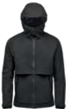
M's & W's: Black