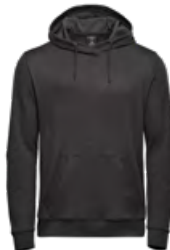
M's & W's: Graphite