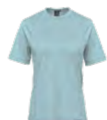
W's: Ice Blue Heather