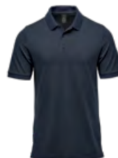
M's & W's: Navy