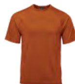
M's: Rust Heather