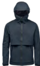
M's & W's: Navy