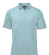
M's & W's: Ice Blue