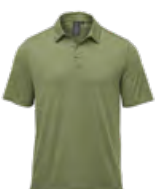
M's & W's: Sage Green