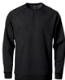
M's & W's: Black

Pure Earth by STORMTECH™ Made from Recycled Polyester and BCI Sourced Cotton for a reduced environmental footprint 59% BCI COTTON/ 41% RECYCLED POLYESTER