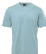
M's & W's: Ice Blue