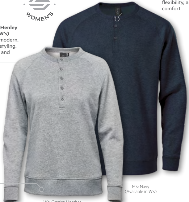
W's: Granite Heather (Available in M's)

5-Button Henley Placket (W's) Provides modern, premium styling, flexibility, and comfort