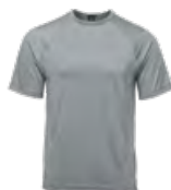
M's & W's: Granite Heather