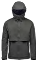
M's & W's: Dolphin