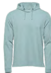
M's & W's: Ice Blue