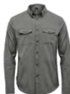
M's & W's: Heather Grey