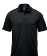
M's & W's: Black