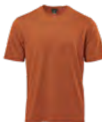
M's & W's: Rust