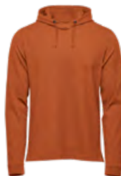
M's & W's: Rust