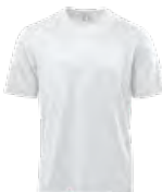
M's & W's: White