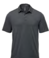
M's & W's: Dolphin