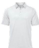
M's & W's: White