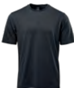
M's & W's: Navy