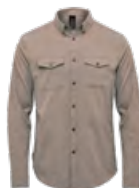
M's & W's: Taupe