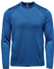
M's & W's: Classic Blue Heather