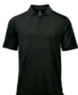
M's & W's: Black